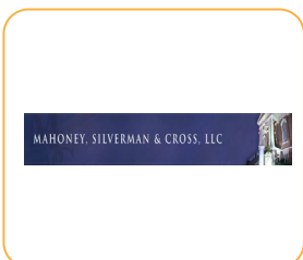
Mahoney, Silverman & Cross, LLC