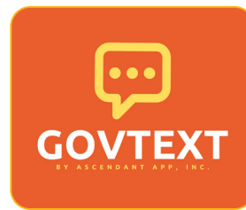
Ascendant App, Inc.